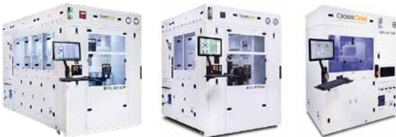
The single-wafer processing Solstice Platform is available with 8, 4, 3 or 2 chambers in customizable configurations, depending on the applications you require.