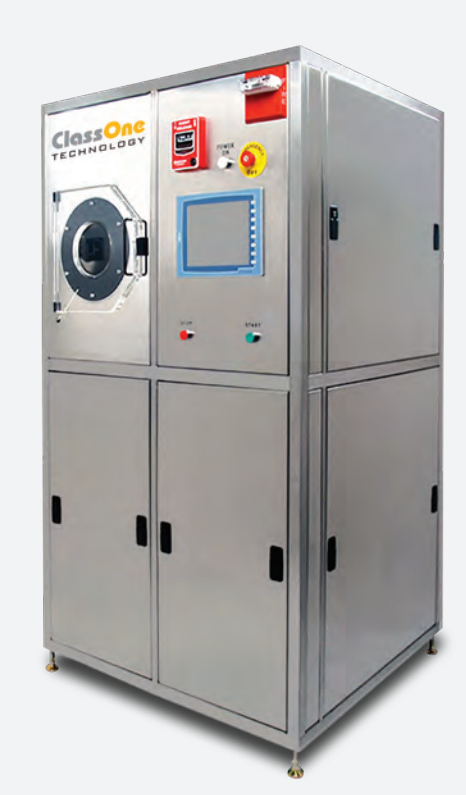
Trident Spray Solvent Tool

Bottom line, Trident SSTs increase uptime and productivity while significantly reducing capital expense — with system pricing that is significantly lower than competitive spray solvent tools.